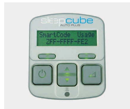
SleepCube with SmartCode display