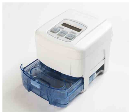
SleepCube with integrated heated humidifier